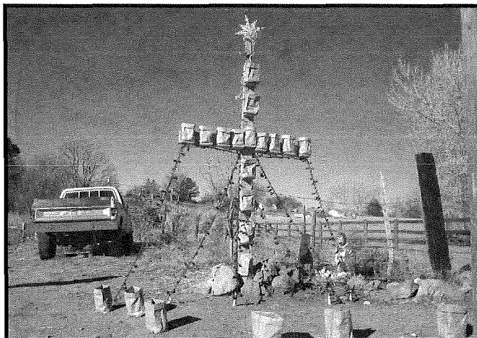
After Tacho Sandoval passed away in 2012, the family created this lovely cross of farolitos at Xmas in his memory.

The restoration structures performed exactly as designed and were not affected by the power of the floods. They have begun blending into the landscape and over time will likely (Cont. p.2)