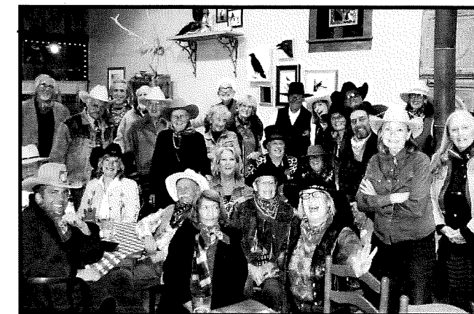
The GVFR's cowboy/girl themed holiday dinner at the Black Bird Saloon in Cerrillos on December 12.