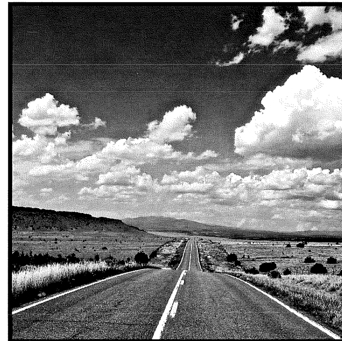
Soon to be History