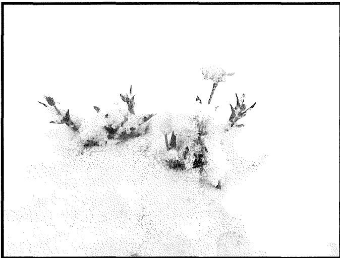
Irises in the snow. They loved it.