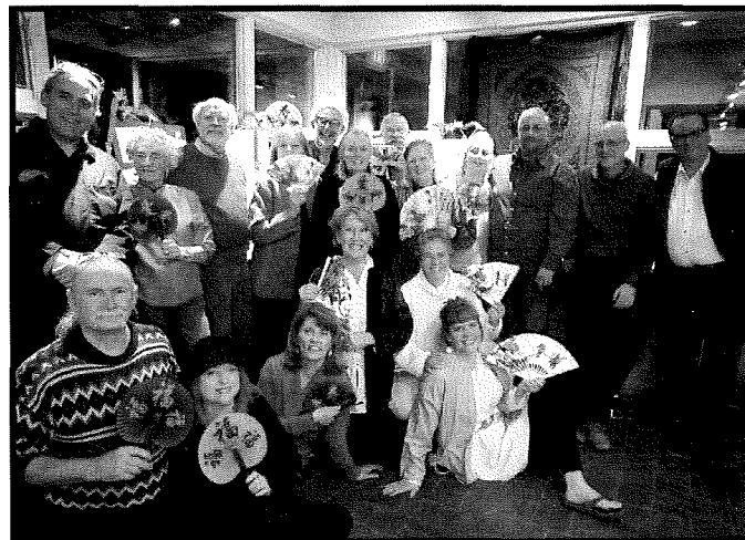
Members and partners at the Chinese New Year themed GVFR Party

If you joined the Galisteo Volunteer Fire and Rescue, you could attend our delicious and entertaining holiday parties! The GVFR always needs volunteers, any age, size, shape. It is hard and rewarding work. The Auxiliary is a good entry point. Many trainings are available to become a firefighter or EMT. Come to a business meeting the first Tuesday of each month at 6:30 or drop by the Fire Station on Avenida Vieja any Tuesday night to connect and learn.