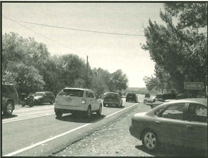
Downtown Galisteo at Studio Tour.