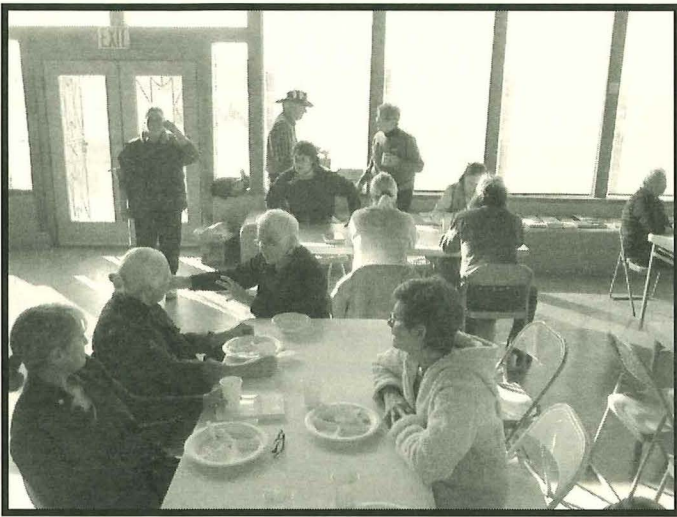
Coffee and Book Exchange, February 4 th