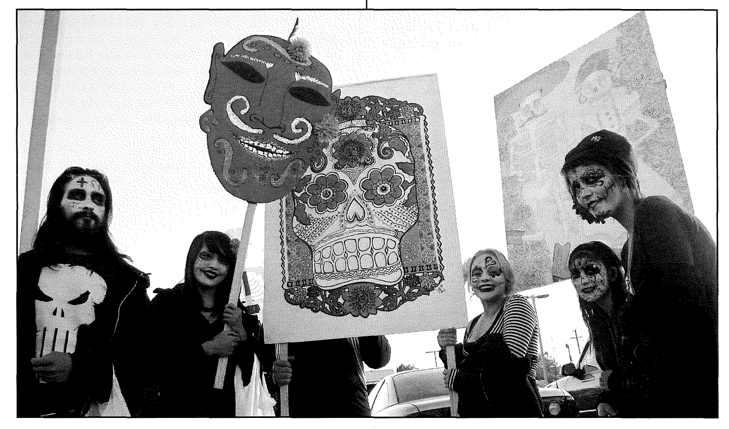
The Marigold Day Parade (Day of the Dead) in Albuquerque's South Valley.