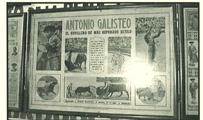
Bullfight poster in a restaurant in Sevilla, Spain.