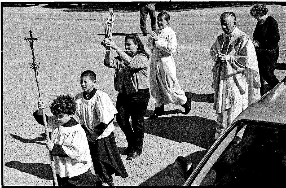
125 th Anniversary Procession at Church

At 44 cents a paper, ten months a year, postage comes to $660 -- almost as much as print costs. I don't want to raise the sponsorship amount above all of our heads. (Postage is cont. p2 )