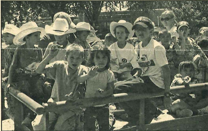
Kids in Rodeo Parade

This would minimize disturbance of the wetlands (and our lives) to some extent. If they do not hear from us, they are all too likely to revert to the original, much more grandiose plan -- either two parallel bridges or total replacement, which would mean months of construction and a very different gateway to the village. SO PLEASE write Karyn Lujan, NMDOT District 5, POB 4127, Santa Fe NM 8750, or e-mail at Karyn.Lujan@state.nm.us.