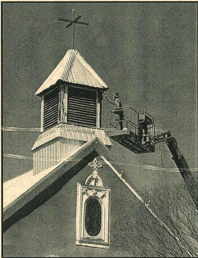
The church is spruced up in time for Easter.