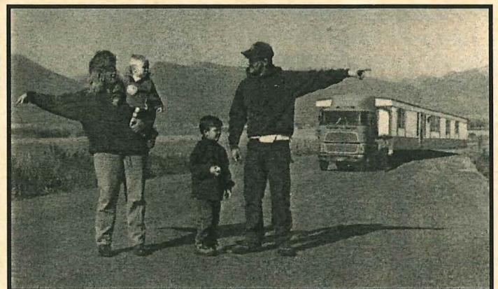
Members of the Galisteo Community Plan steering committee discuss Galisteo boundaries.

Coming in next issue: Up-dates on up-dated up-dates will be up-dated concerning land use meetings, the cemetery, and road surfaces.