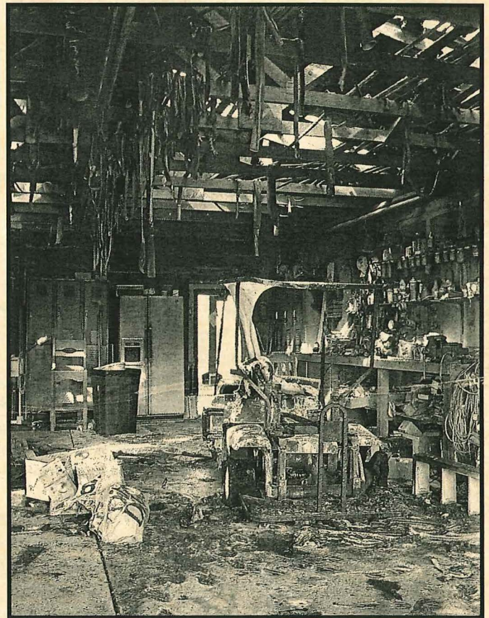
The Fire at Vista Clara left this shed a mess.