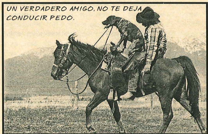
UN VERDADERO AMIGO, NO TE DEJA CONducIR PEDO.

Side-o-the-Road Hogan, Inc., Build that dream hogan you've always wanted (or that dream teepee or that little room with a toilet and a hot plate in it)! Call Morgan for more info.