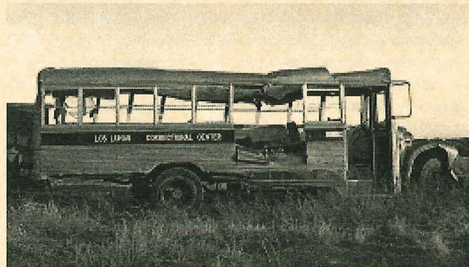
ABOVE: And what about the Los Lunas Corrections Department bus that graces the Transfer Station?

It also seems that through the years there have been frequent and recurring State Environmental Protection Agency code violations, like timely and proper disposal of brush, appliances, and tires. These may aid the Coalition's battle to prove that the County is not running the dump properly and that the addition of the Public Works Facility is inappropriate. ( continued p.2 )